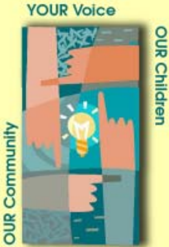
Newsletter for the Lancaster County Community Groups

As the nation's current debate on the 21 Minimum Legal Drinking Age (MLDA) continues, it can be easy to mistake opinions for facts. Why21.org offers the straight truth on why the MLDA law is important to you regardless of your age and describes how it saves lives. Arm yourself with the truth and then decide. Visit www.why21.org for more resources.